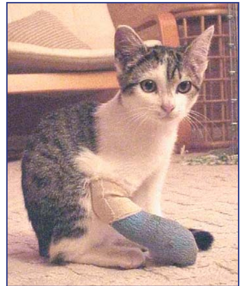
The young Cindy Crawford

As we watched TV, a documentary on the presidency provided some inspiration: Dolly of Dolly Madison. And Molly Ivans was on a news show. Following the rhyme, Polly was our